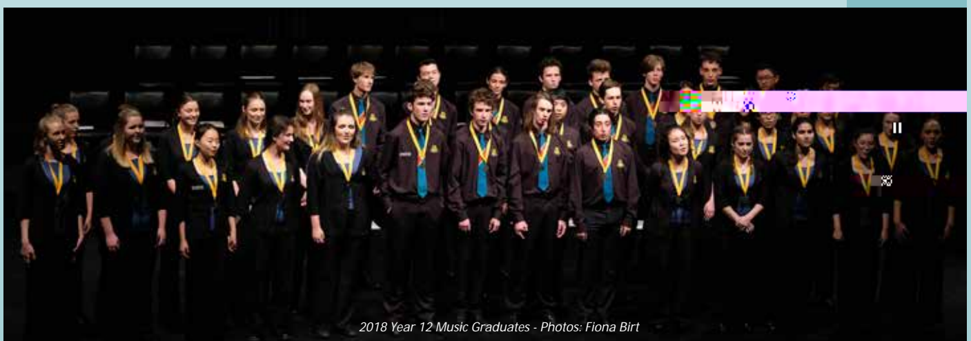
2018 Year 12 Music Graduates